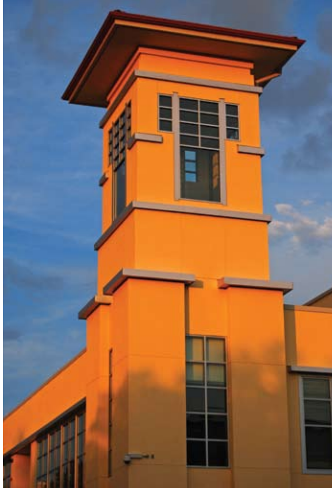
The University of Texas—San Antonio (new building) University Center San Antonio, Texas