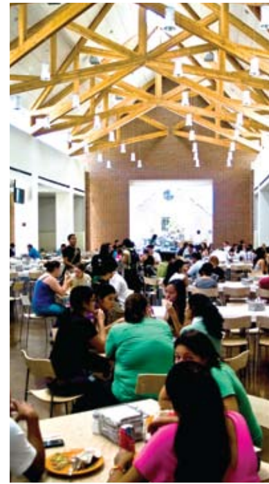
University of the Pacific (new building) Don and Karen DeRosa University Center Stockton, Calif.