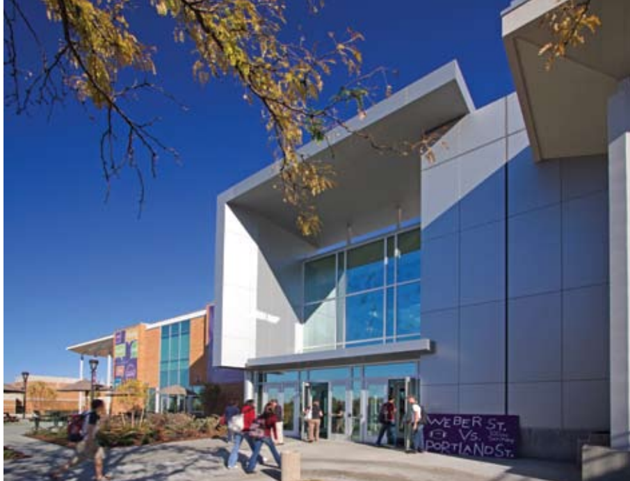
Weber State University (renovation/addition) Shepherd Student Union Salt Lake City, Utah

SUBMITTED BY: Liz Pulu, Marketing Coordinator Private, commuter FULL-TIME ENROLLMENT: 21,000 ORIGINALLY OPENED: Feb. 1, 1960 REOPENED: Aug. 15, 2008 AREA ADDED: 21,026 sq. ft. TOTAL AREA: 188,952 sq. ft. FLOORS: 4 ASSIGNABLE SPACE: 58% PROJECT COST: $23.6 million FUNDING SOURCE: 100% student fees ARCHITECTS: MHTN Architects, Inc. – Salt Lake City