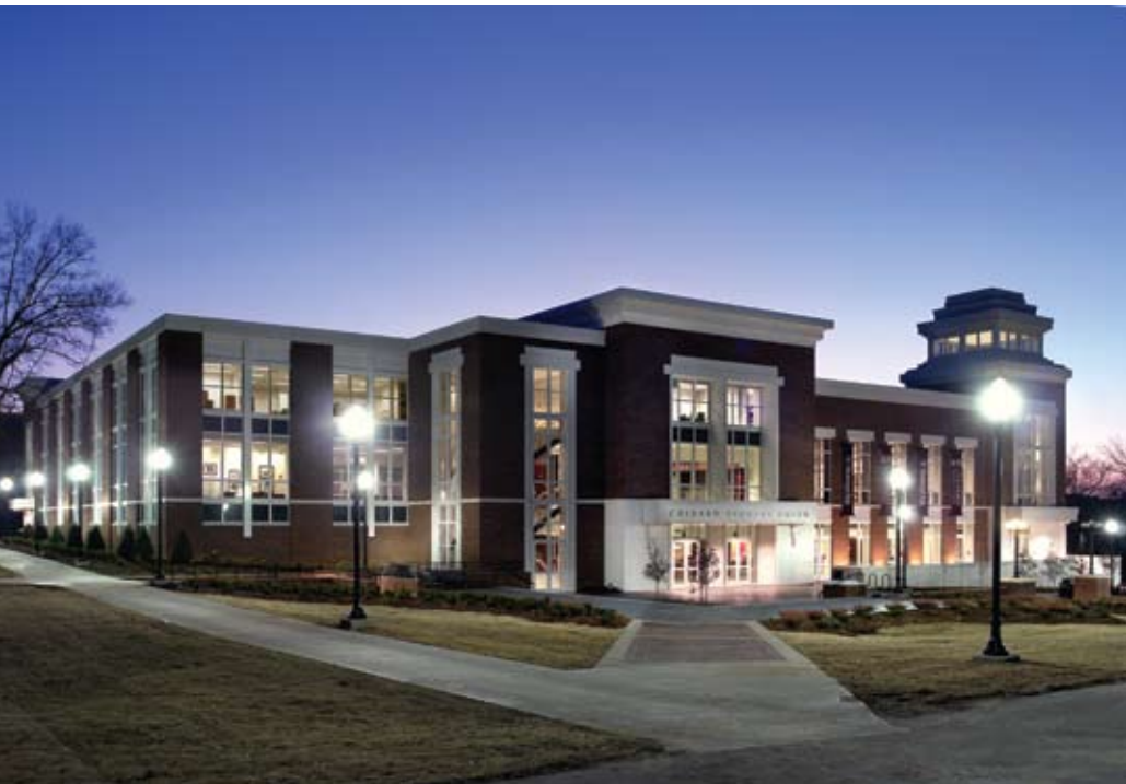
Mississippi State University (renovation/addition) Colvard Student Union Mississippi State, Miss.

M ississippi State University's Colvard Student Union needed a renovation and addition. It was not meeting ADA and fire safety codes, it was not large enough for the increased student body, and it was not meeting the needs of the student body. So, a consultant was hired, students and staff started touring recently renovated unions, and the renovation began.