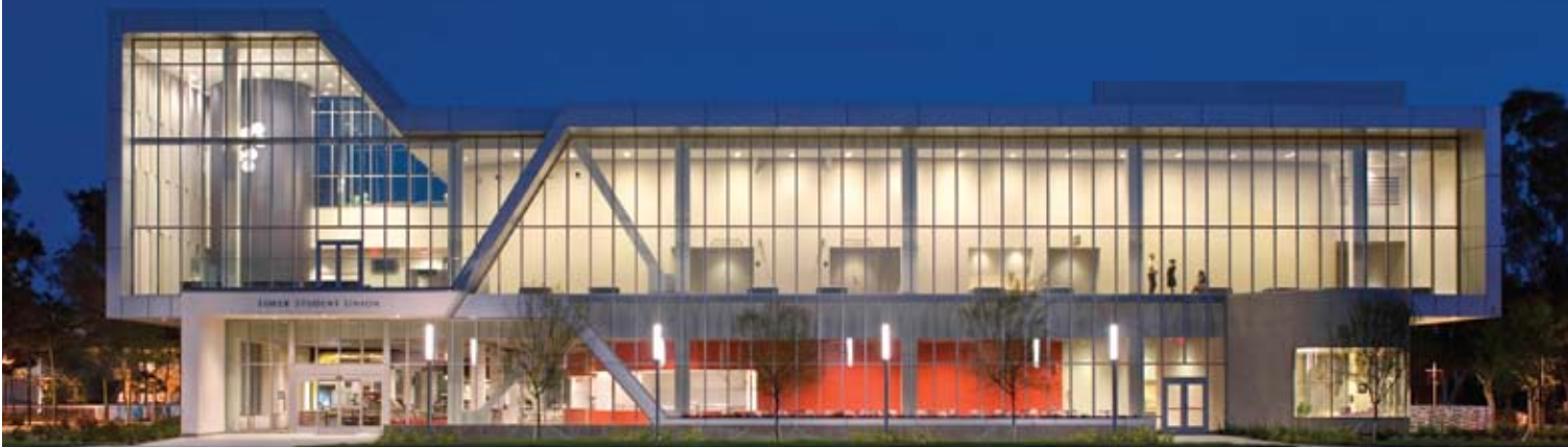
California State University-Dominguez Hills | Loker Student Union | Carson, Calif.